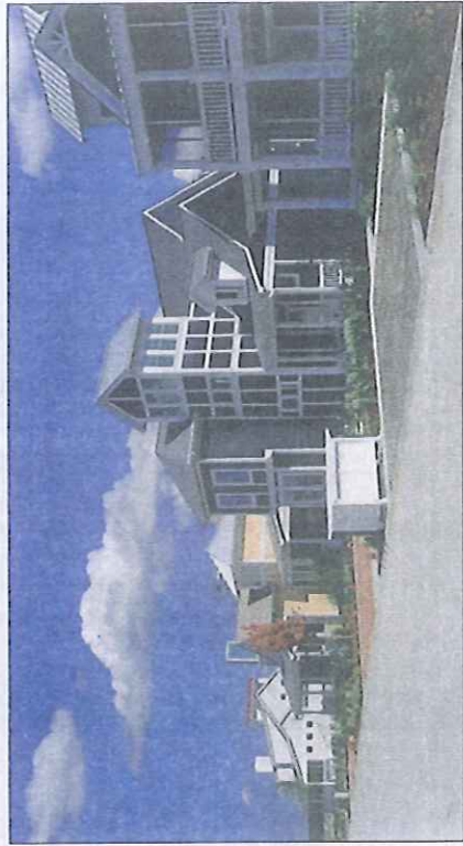
Near Starved Rock State Park, Heritage Harbor Ottawa Resort is building waterfront homes and cottages around a 32-acre marina.

beautiful views of the community's two lakes. They also have access to fishing, canoeing and kayaking. The property, which was originally part of Marshall Field's private estate, features a preserved wooded shoreline surrounding portions of the lakes.