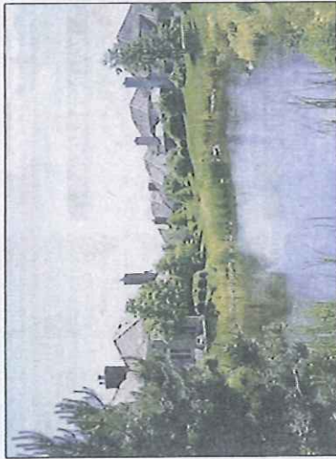
At Meadow Ridge in Northbrook, Red Seal Homes offers maintenance-free living where the landscaping, snow plowing and exterior maintenance are provided for homeowners.

At Red Seal Homes' Willow Lake community in Lake Forest, residents enjoy more than