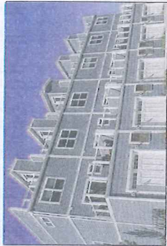
Heritage Harbor Ottawa Resort offers a unique location in the Starved Rock area.

Meadow Ridge offers two-story homes with main-floor master suite and traditional two-stories with all the